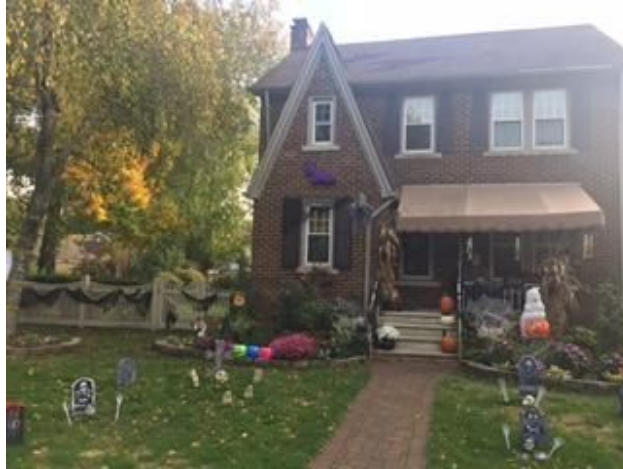
9624 Auburndale Street